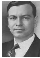
Ellis Arnall, Melvin Thompson, and Herman Talmadge – the three men in the 1946 Governor's Race.

In 1946, Georgia had an election for governor that was surrounded in scandal. Eugene Talmadge was elected governor. He died before he could begin his term. After this, there was a debate over who should be governor in Georgia. Melvin Thompson, who was the lieutenant governor-elect, thought he should be governor. Because many people in Georgia wrote in the name of Herman Talmadge underneath Eugene Talmadge's name, Herman Talmadge thought he should be governor. Ellis Arnall declared that he would remain governor until the issue was resolved. In the end, the state decided that Melvin Thompson should be governor until a special election was held. After the special election, Herman Talmadge was elected. The 1946 governor's race made Georgia look foolish and created a great deal of confusion.